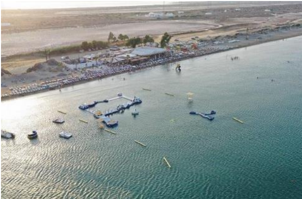
Lady's mile beach