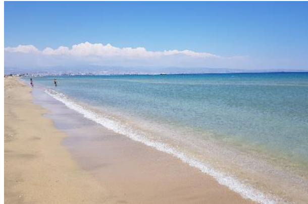
Lady's mile beach