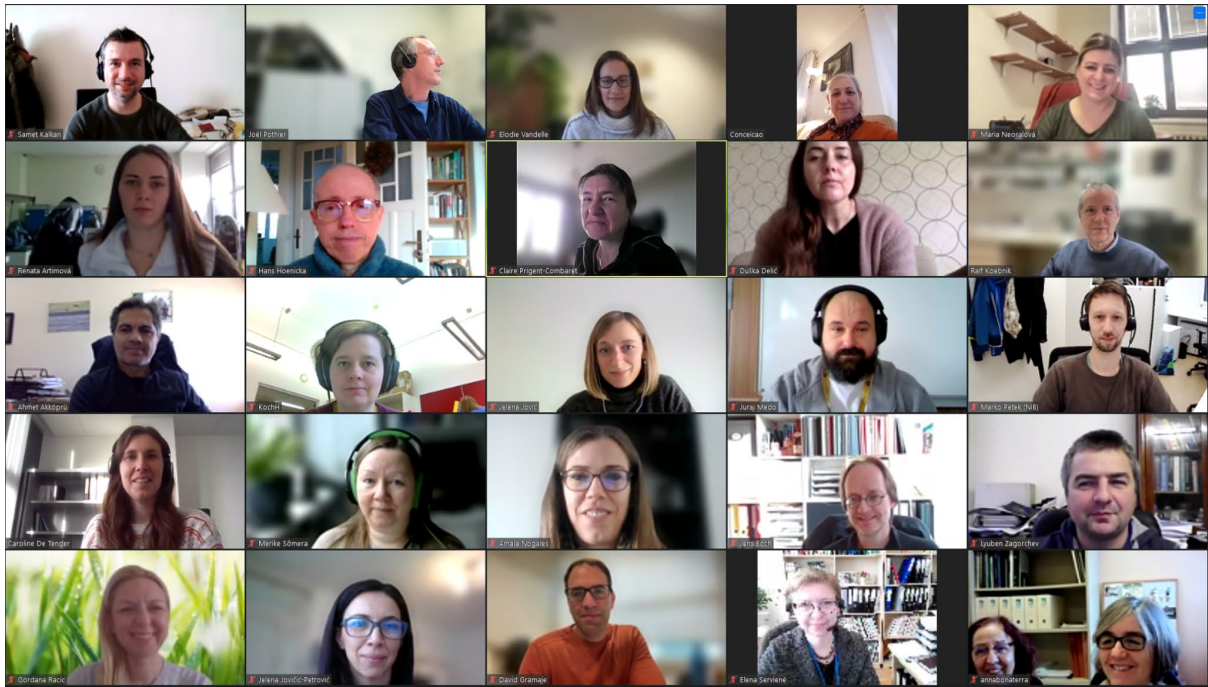
Twenty-six of the 39 participants in the WG3 Online Meeting via Zoom